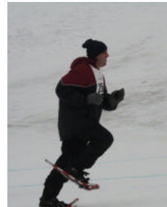
Winter Games, page 3