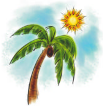
Key West Fundraiser, page 6

Newsletter Production is provided by The Printing Press, Leonardtown, MD; Mailing by Patuxent Moose Lodge