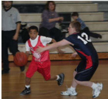
Basketball, page 1